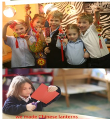
We made Chinese lanterns