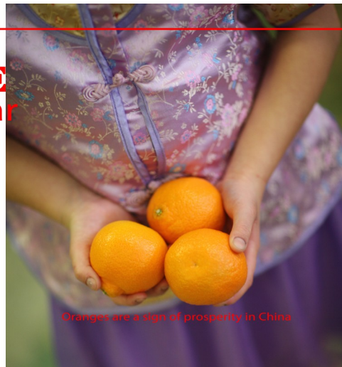
Oranges are a sign of prosperity in China